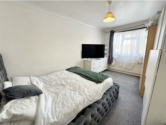
Double glazed window to front elevation - radiator - power points - carpet to remain.