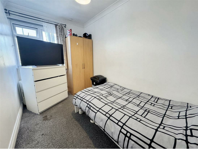
Double glazed window to front elevation - radiator - power points - carpet to remain.